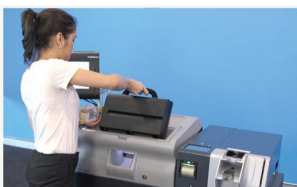
2. Bulk coin deposit.