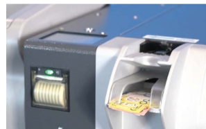
3. Pick up note float.