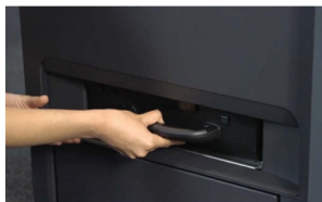
2. Insert UCD in chute.