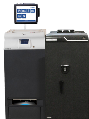
Behind the counter