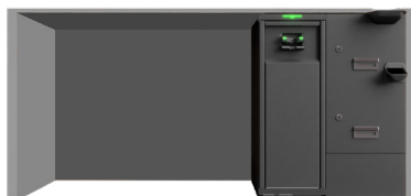
Under the counter

Our Cash Recycling Solutions are available for small, medium, and large size venues as their capacity is dependent on your cash volumes and business needs.