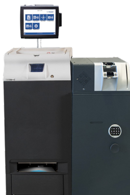
Behind the counter